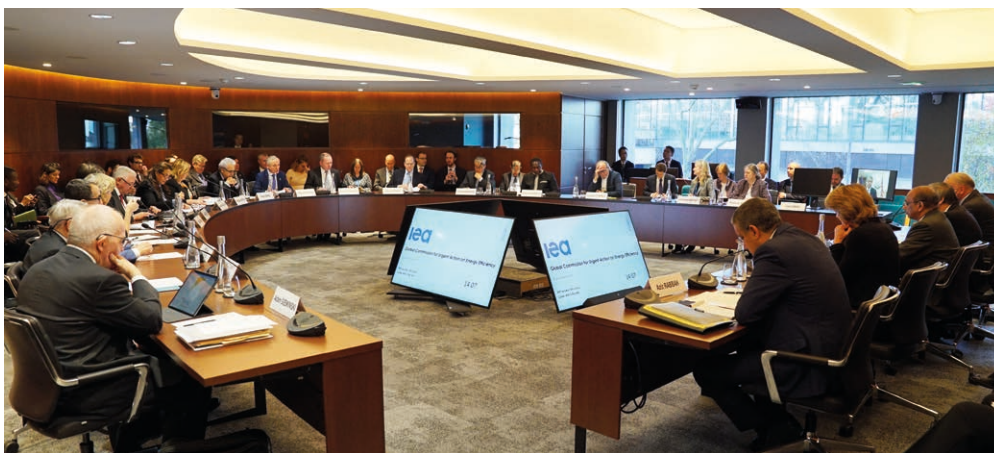
An early meeting of the IEA's Global Commission for Urgent Action on Energy Efficiency